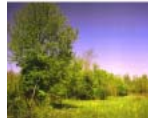
“Along Meadow Trail”