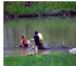
“Playing in the Water”