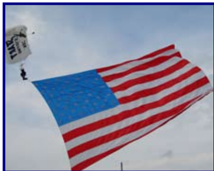
A skydiver from Team Fastrax unfurls the American flag during an infield jump at the fairgrounds