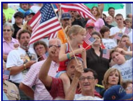
The crowd waves flags during the singing of God Bless the USA